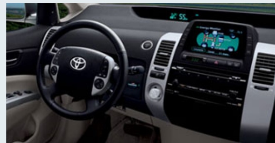
Prius interior shown in Bisque