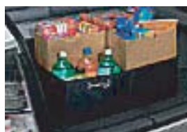
Cargo Tote $40.00 Installed MSRP*