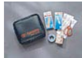
First Aid Kit $29.00 Installed MSRP*