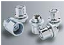
Wheel Locks (alloy) $65.00 Installed MSRP*

These exterior accessories are also available: