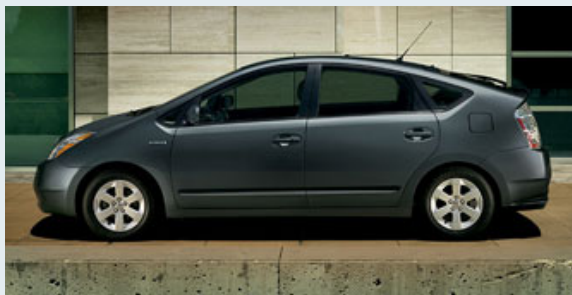
Prius shown in Magnetic Gray Metallic