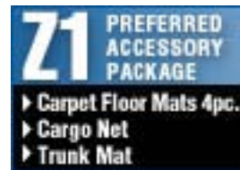
Preferred Accessory Package $277.00 Installed MSRP*