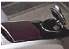
Ashtray Cup $30.00 Parts Only MSRP**