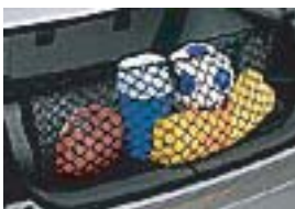
Cargo Net $49.00 Installed MSRP*