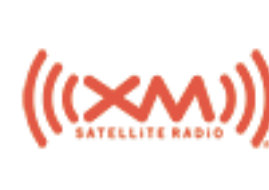
XM Satellite Radio $449.00 Installed MSRP*