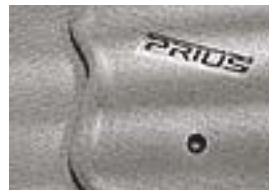
Carpet Floor Mats & Cargo Mat Set $199.00 Installed MSRP*