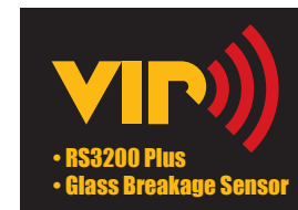
VIP Security Systems RS3200 Plus $249.00 Installed MSRP* Glass Breakage Sensor (GBS) $165.00 Installed MSRP*