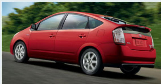
Touring shown in Barcelona Red Metallic