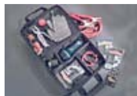
Emergency Assistance Kit $70.00 Installed MSRP*