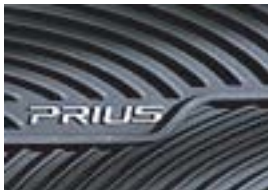
All Weather Mats $99.00 Parts Only MSRP**