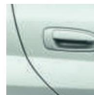
Aqua Ice Opalescent with Gray Interior