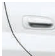
Super White with Gray Interior