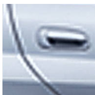
Blue Moon Pearl with Gray Interior