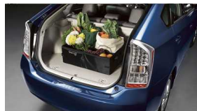
Cargo tote by Nifty Products $40 Installed MSRP*