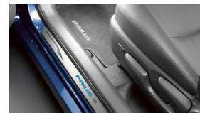
Illuminated door sill $359 Installed MSRP*