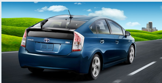
Prius V shown in Blue Ribbon Metallic with available Advanced Technology Package [28]