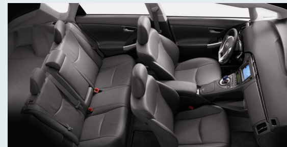
Prius interior shown in Dark Gray leather with available Advance Technology Package [28]