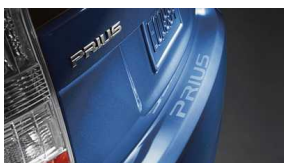
Rear bumper applique $69 Installed MSRP*