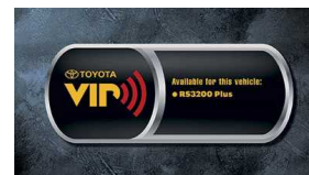
VIP RS3200Plus Security System $359 Installed MSRP*