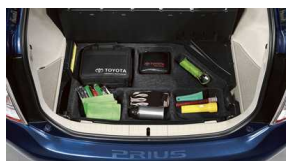
Cargo Organizer $49 Installed MSRP*