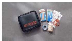
First aid kit $29 Installed MSRP*