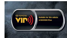
VIP RS3200Plus Security System $359 Installed MSRP*