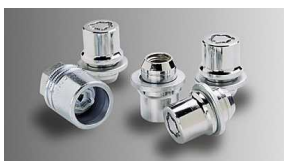
Wheel locks (alloy) $67 Installed MSRP*