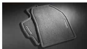
Carpet Floor Mats & Cargo Mat $200 Installed MSRP*