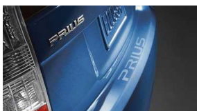
Rear bumper applique $69 Installed MSRP*