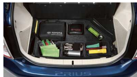
Cargo Organizer $49 Installed MSRP*