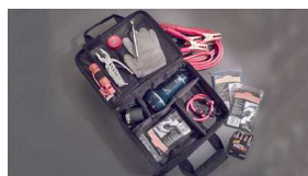
Emergency assistance kit $70 Installed MSRP*