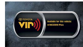
VIP RS3200Plus Security System $359 Installed MSRP*