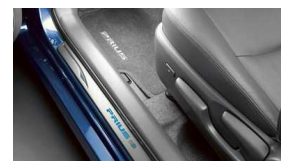
Illuminated door sill $359 Installed MSRP*