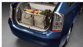
Cargo Net $51 Installed MSRP*