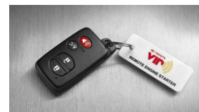
Remote engine start $529 Installed MSRP*