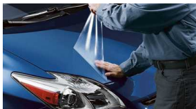
Paint protection film $395 Installed MSRP*