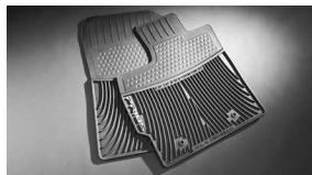
All-weather Floor/Cargo Mats - 5pc Set $199 Installed MSRP*