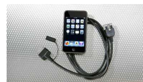
iPod Interface $299 Installed MSRP*