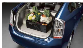
Cargo tote by Nifty Products $40 Installed MSRP*