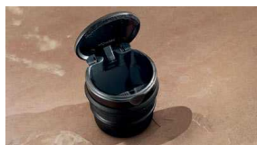
Ashtray Cup $17 Parts Only MSRP**