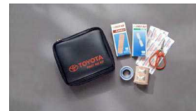
First aid kit $29 Installed MSRP*