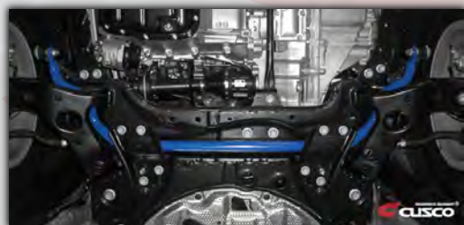
FRONT SWAY BAR PART NO: 925 311 A30 MSRP: 30,000 yen (JPY) $400.00 (USD)