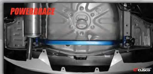
POWERBRACE REAR END PART NO: 952 492 RE MSRP: 8,500 yen (JPY) $114.00 (USD)