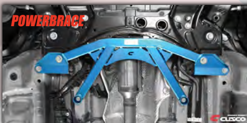
POWERBRACE FRONT PART NO: 951 492 F MSRP: 19,000 yen (JPY) $254.00 (USD)