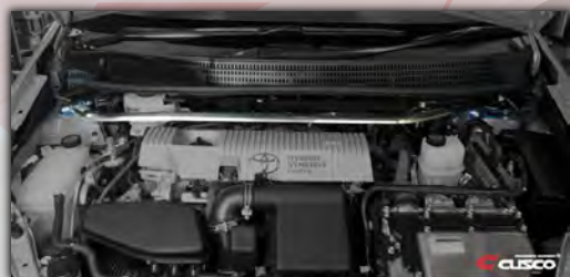
TYPE OS STRUT BAR (LHD Models) PART NO: Still Under Development MSRP: TBD