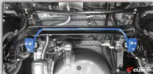
REAR STABILIZER BAR PART NO: 942 311 B16 MSRP: 25,000 yen (JPY) $334.00 (USD)