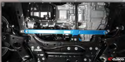
LOWER ARM BAR VERSION 1 PART NO: 942 475 A MSRP: 7,500 yen (JPY) $100.00 (USD)