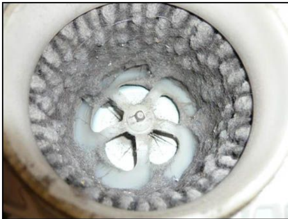
Figure 1. HV Battery Cooling Fan BEFORE Cleaning